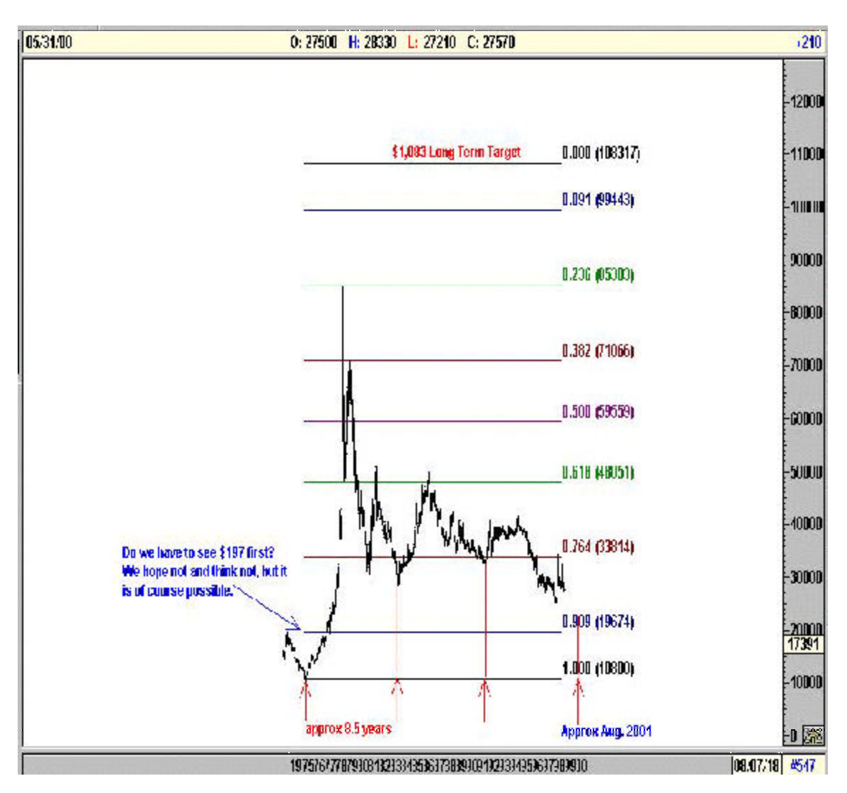
Do I sound suddenly and uncharacteristically bearish? Well I am worried, but I am not quite a bear here – at least not yet.

Unfortunately using this technique alone, one might expect that gold bulls will have yet another year of purgatory as this market slowly sets itself up for the final resumption of its longer-term uptrend . With time we have no doubt that gold will eventually vault to a 5<sup>th</sup> wave high toward $1,083 basis its overall longer-term Fibonacci rhythm and wave count depicted below. This should leave the entire last twenty years as an extensive wave 4 correction. But the question remains what will we do between now and August 2001? Might we have to visit $197 first? We certainly hope not, but if the above mentioned cycle plays itself out, this final bear phase could certainly last just long enough and move just low enough in price to bankrupt a few more mining houses – thereby sewing the seeds for the final reversal and recovery.